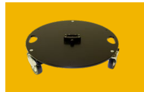
HEAVY DUTY BASE PLATE