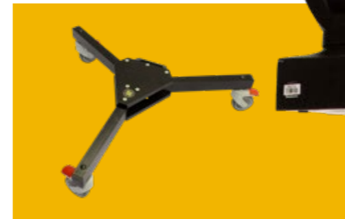
FOLDING WHEELED DOLLY