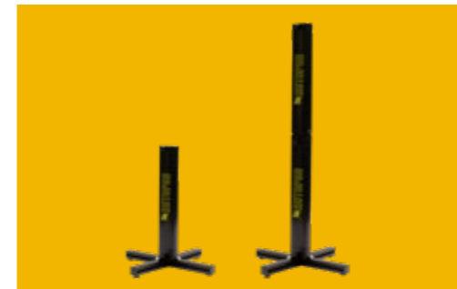
ADDITIONAL ELEVATION UNIT