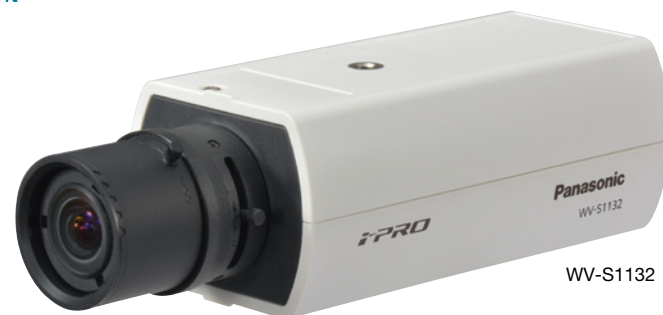
Lens : Optional