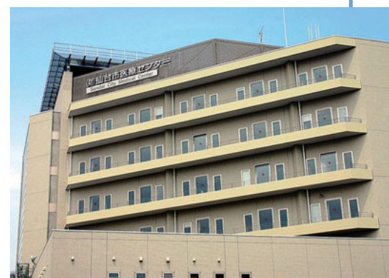
The new hospital building was completed and entered operation in May 2005.