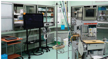
In the cardiac surgery room, 42” high-definition mobile plasma display units on mobile stands with castors are used for easy viewing during operations.

Selecting the image source to display on the plasma display (endoscopic image, PACS* image, pathologic image, electrocardiogram and so on), selecting the plasma display multi-screen display mode, adjusting the ceiling arm rotation