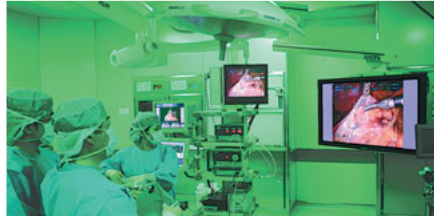
In the endoscopic operating room, a 42” high-definition plasma display unit is also suspended from the ceiling on an arm on the opposite side.

and angle, recording on the HDD recorder, adjusting the room lighting and surgical lights and other adjustments can all be controlled from a single touch panel.