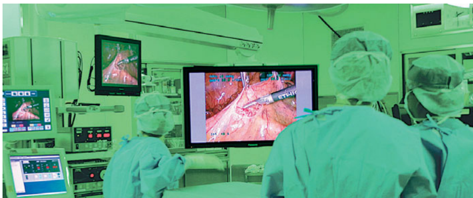
In the two endoscopic operating rooms, 42" high-definition plasma display units are suspended from the ceiling on arms. [Note]The walls of the operating room are painted light green to eliminate complementary color afterimages due to the red color of blood. At the Sendai Open Hospital, green lighting is also used.

We looked at several companies' products, but we liked Panasonic's high-definition and SDI support, and decided to go with Panasonic. We were able to get system specifications that fully met our needs for things like touch-panel system control and networking inside the hospital, and the installation went smoothly. We started using them in May 2005.